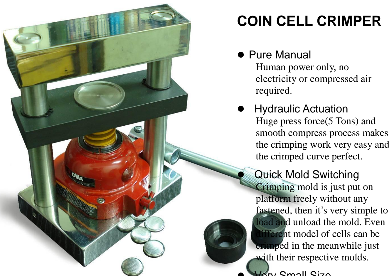
Fig. 1 CR-02 Overview