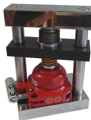
Fig. 3 Crimper with mold